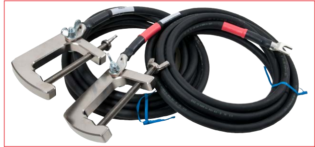
Cable set, GA-07052 and 100 mm clamp jaw width. The sets GA-07102 and GA-09152 have the same clamps.