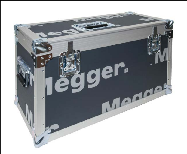
Transport case, GD-00182