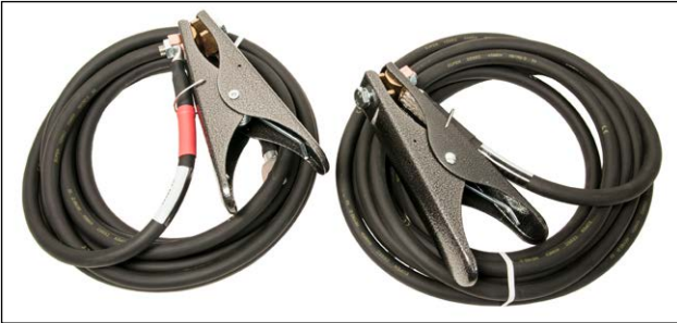
Cable set, GA-05052