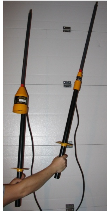
Special LLI with handles for Rail Networks Operation