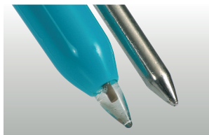
testo 206-pH2: pH2 probe head for semi-solid food