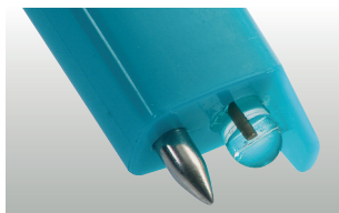
testo 206-pH1: pH1 probe head for liquids