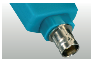
testo 206-pH3: pH3 probe head with BNC interface