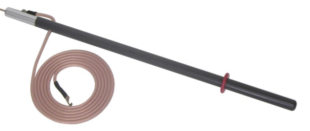
ES30 Earthing stick

Supply lead, spare fuse set, operating manual, earth lead, ES30 earthing stick.