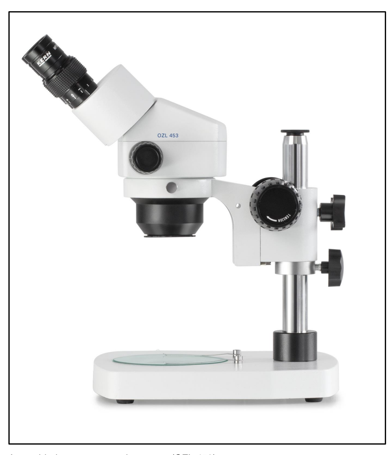
Assembled stereo zoom microscope (OZL 453)