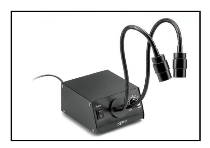
Typical goose neck lighting unit

The lighting units which are suitable for devices of the OZL-44 series, are goose neck lighting units (see figure). These are available as LED as well as halogen versions and also have an on/off switch or different controller.