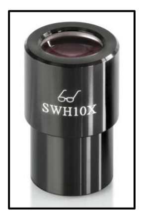
High Eye Point eyepiece (identified by the glasses symbol)