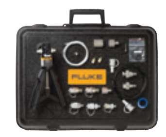
Fluke-700PTPK2 Pneumatic Test Kit