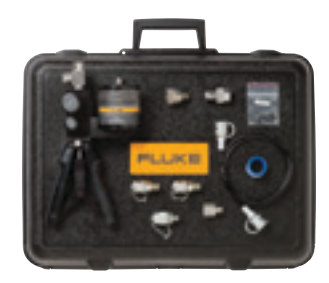
Fluke-700HTPK2 Hvdraulic Test Kit