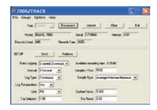
700G/TRACK Logging Software