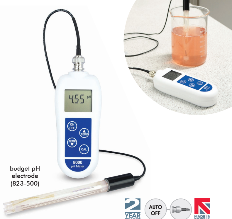
budget pH electrode (823-500)

the 8000 pH meter is inclusive of pH electrode