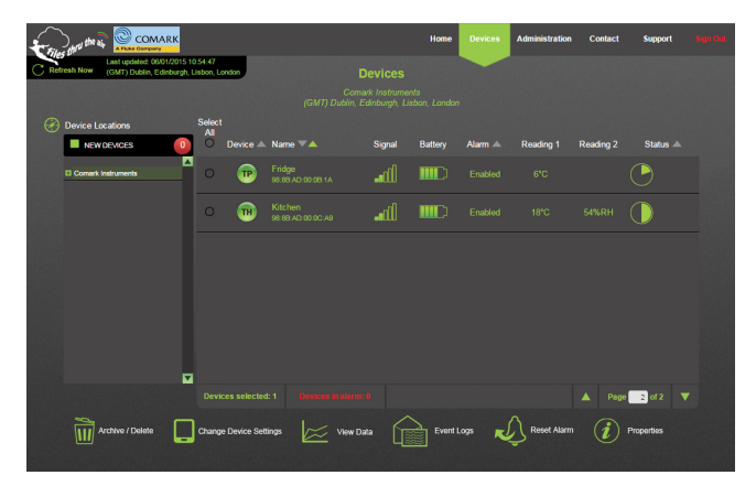
RF300 Transmitter List

View the status of transmitters in your network