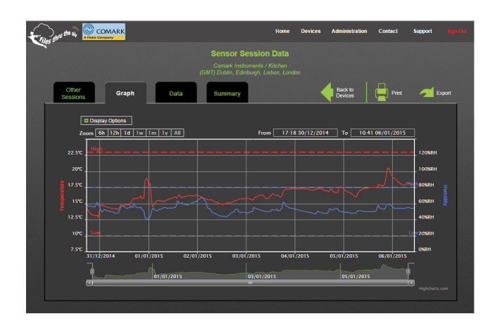
Temperature Data - Graph Format

View details of an individual transmitter