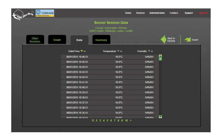
Temperature Data - Tabular Format