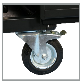
LOCKABLE, SWIVEL REAR WHEELS