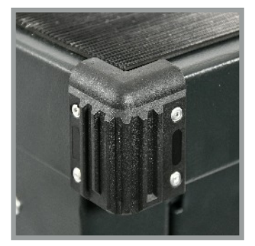
PROTECTIVE CORNER GUARDS