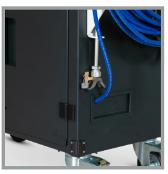
CABLE, HOSE & GUN STORAGE