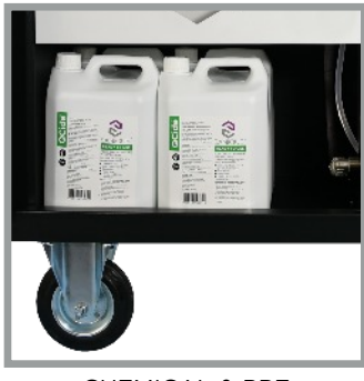
CHEMICAL & PPE STORAGE