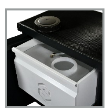
LOCKABLE, 18L ENCLOSED SANTISER TANK