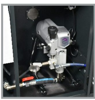
INDUSTRIALLY RATED HIGH VOLUME PUMP